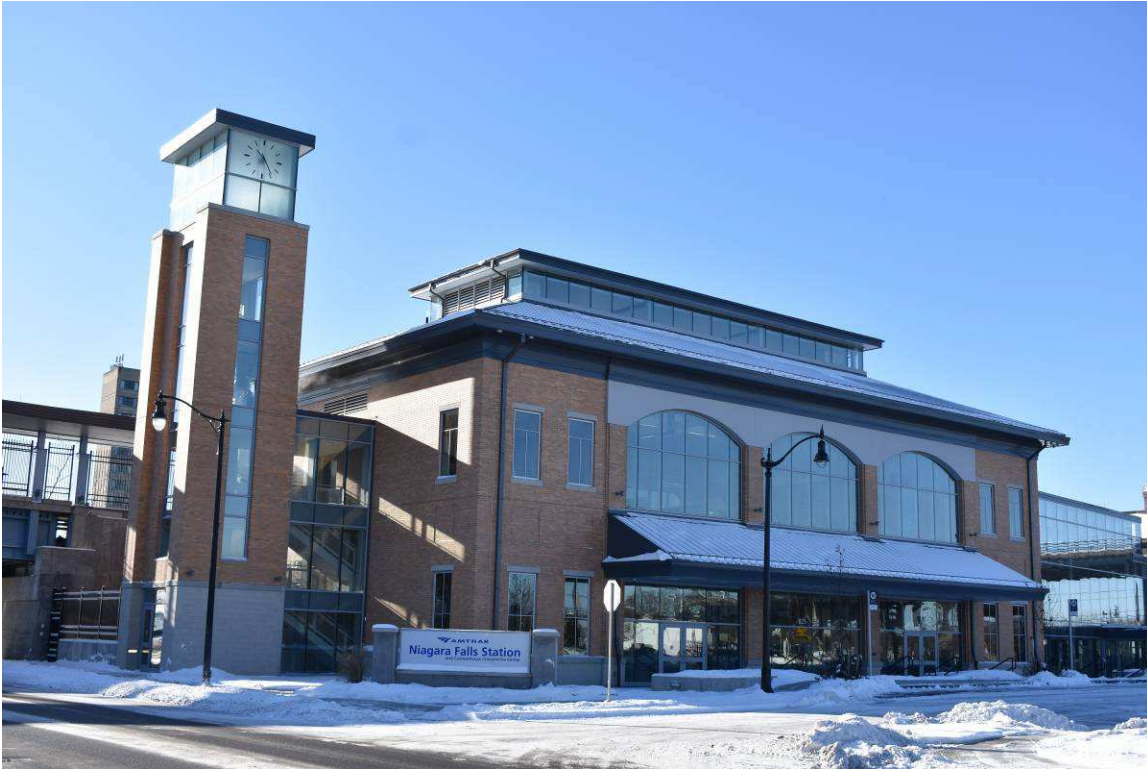
Amtrak's impressive new Niagara Falls, NY station is also up and operating. December 26, 2017.