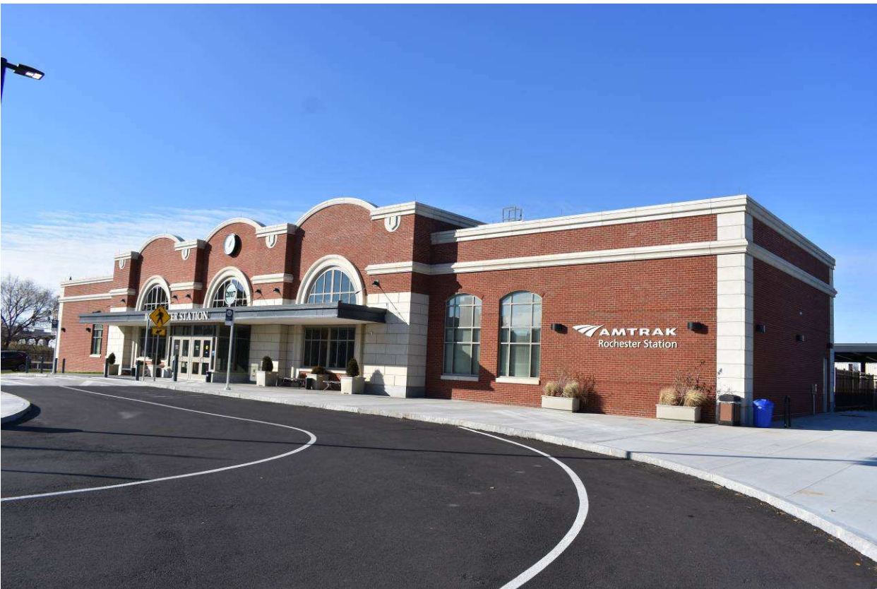
Amtrak's new Rochester, NY passenger station is now open. December 9, 2017.