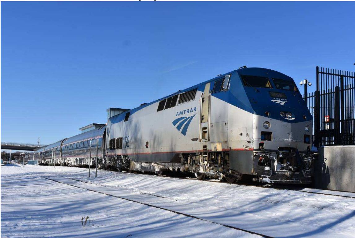
The Maple Leaf, eastbound to New York City, pauses at the new Niagara Falls, NY station. December 26, 2017.