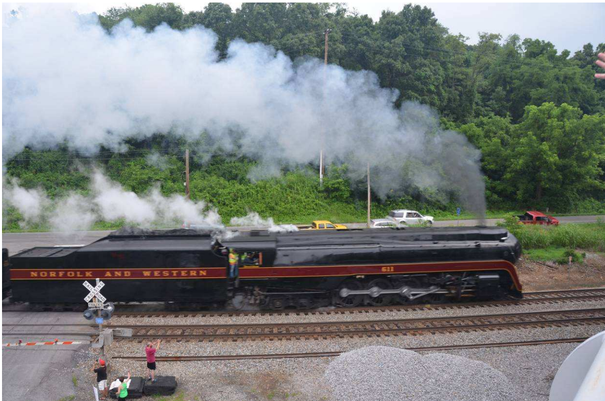
Eastbound out of Roanoke, Va. Norfolk & Western #611 is viewed from an overpass on the Blue Ridge Parkway. July 3, 2015