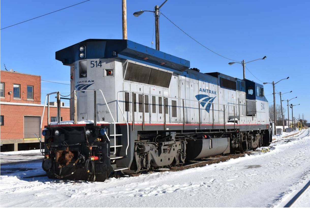
Amtrak #514 rests at the former Niagara Falls station. The building was constructed for the Lehigh Valley RR as an express freight station during the early 1960's when Niagara Falls 'urban removal' relocated tracks out of downtown Niagara Falls. LVRR had trackage rights from Tonawanda Jct. to the Falls over NYC. December 26, 2017.