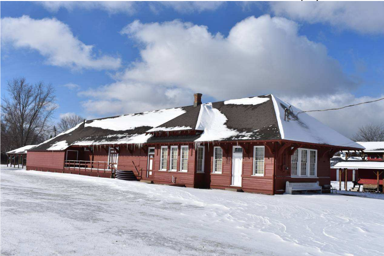
The former New York Central Wilson, NY depot is now a local Historical museum. The old Hojack railroad line is now mostly a rail trail. December 26, 2017.